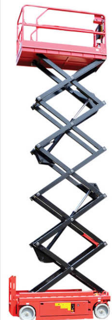
ZS1623RT Scissors Rough Terrain Power Type: Electric Platform Capacity: 680 kg Working Height: 18m