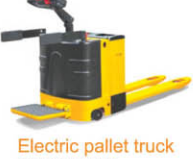
Electric pallet truck Model: CBD20M Cap. : 2000kg