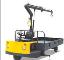
Electric truck with crane Model: DC500 Cap. : 2000kg