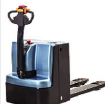
P16/18 Capacity: 1.6/1.8T Fork Width: 540/685mm Fork Length: 1150/1220mm ZAPI Full AC Battery: 24V 240AH