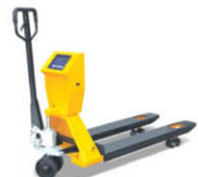
Scale pallet truck Model: BFC6 BFC6 stainless steel BFC6-II with printer Cap. : 2000kg