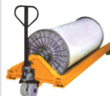
Hydraulic big X-sign fully loaded beam conveyor Suitable for the transportation of the big width fully loaded warp beam Capacity: 1500kg Overall size: depends on the specifications of the beam