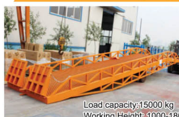
15t Heavy Duty Loading Ramps

Load capacity:15000kg Working Height:1000-1800 mm Platform size:11000*2000mm