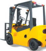
Diesel forklift truck Model : FD15/FD20/FD25/FD30/FD35 Cap. : 1500kg~3500kg Lift height: 3m~6m