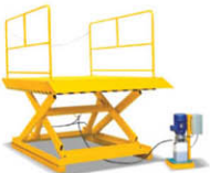
Stationary lift table Model: AL1/AL2 Cap. : 2700kg, 1000kg