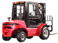
T20/25/30/35A Capacity: 2.0/2.5/3.0/3.5T Lifting Height: 3000mm Max. Lifting Height: 6500mm Drive Type: 4x4