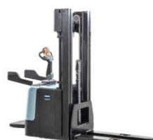
S20L-T Capacity: 2.0T Lifting Height: 3000mm Max. Lifting Height: 4500mm ZAPI Full AC Battery: 24V 270AH