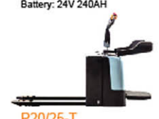
P20/25-T Capacity: 2.0/2.5T Fork Width: 540/685mm Fork Length: 1150/1220mm ZAPI Full AC Battery: 24V 240/270AH