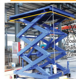
Cargo Scissor Lift

Load capacity : 2000kg Platform size: 1800x1200mm Travel : 3500mm