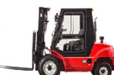
T30/35 Capacity: 3.0/3.5T Lifting Height: 3000mm Max. Lifting Height: 6500mm Drive Type: 4x2