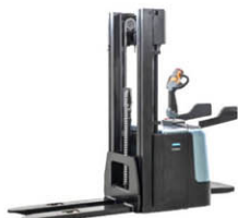
S10/12L-T Capacity: 1.0/1.2T Lifting Height: 3000mm Max. Lifting Height: 4500mm ZAPI Full AC Battery: 24V 210AH