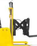
Electric reach stacker (Option EPS) Model : CQDH12A/CQDH15A/CQDH20A Cap. : 1200kg, 1500kg, 2000kg Lift height: 2.5m~6m