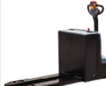
P10/12/14/15 Capacity: 1.0/1.2/1.4/1.5T Fork Width: 540/685mm Fork Length: 1150/1220mm ZAPI Full AC Battery: 24V 210AH