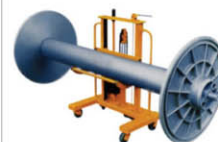
Hydraulic unloaded beam conveyor Suitable for all kind of beam doffing and transporting Capacity: 260kg Overall size: 800x510x1026mm