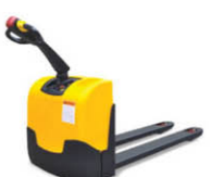
Mini electric pallet truck Model: CBD15W Cap. : 1500kg