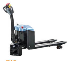
P15 Capacity: 1.5T Fork Width: 550/685mm Fork Length: 1150/1220mm Battery: 24V 20AH Lithium