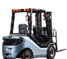
C15 Capacity: 1.5T Lifting Height: 3000mm Max. Lifting Height: 6500mm