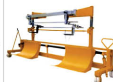
Hydraulic double-bucket beaming vehicle with frame Suitable for double-wrap beam loom (width of cloth between 360 and 390) beaming and transporting Capacity: 2000kg Overall Size: depends on the specifications of the weaving machine