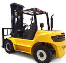
H120 Capacity: 12.0T Lifting Height: 3000mm Max. Lifting Height: 6500mm