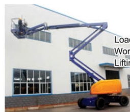
14m Diesel-Powered Articulated Boom Lift

Load capacity : 230kg Working radius: 8000mm Lifting height: 14000mm