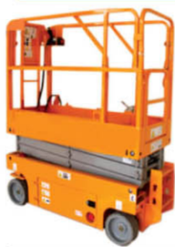
4.8m Mini Electric Scissor Lift

Lifting height 5m Load capacity 280kg Platform size 1.79*0.74m Battery : 4pcs*6/230 v/Ah