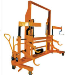
Double-beam towel loom beaming vehicle Suitable for all kinds of dual towel loom beaming Capacity: 2000kg Overall size: depends on the specifications of the weaving machine