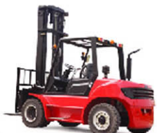
H60/70 Capacity: 6.0/7.0T Lifting Height: 3000mm Max. Lifting Height: 6500mm