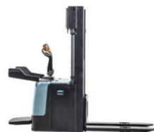
S14L-T Capacity: 1.4T Lifting Height: 3000mm Max. Lifting Height: 4500mm ZAPI Full AC Battery: 24V 210AH