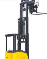
Fork reach truck Model: CQDH15C Cap. : 1500kg Lift height: 3m~6m