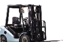
C20 Capacity: 2.0T Lifting Height: 3000mm Max. Lifting Height: 6500mm