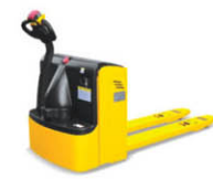
Electric pallet truck Model: CBD20K(D) Cap. : 2000kg