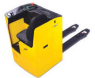
Electric pallet truck Model: CBD20Z/CBD25Z Cap. : 2000kg, 2500kg