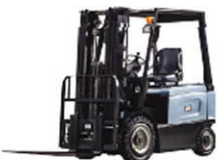
E15/18 Capacity: 1.5/1.8T Lifting Height: 3000mm Max. Lifting Height: 6500mm ZAPI Full AC