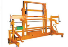
Electrical lifting trolley for double-layer weaving machine Capacity: 2000kg Overall size: depends on the specification of the weaving machine