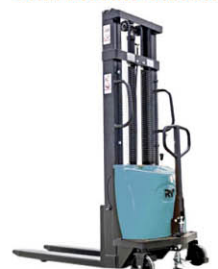
SH10/15/20 Capacity: 1.0/1.5/2.0T Lifting Height: 1600/2000/2500/ 3000/3500mm