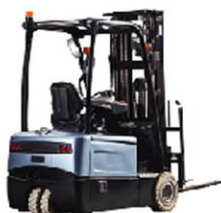
E16/18/20e Capacity: 1.6/1.8/2.0T Lifting Height: 3000mm Max. Lifting Height: 6500mm ZAPI Full AC Dual Driven Motors