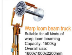
Warp loom beam truck Suitable for all kinds of warp loom beaming Capacity: 1500kg Overall size: 1600x1000x2200mm