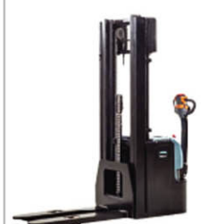
S10/12L Capacity: 1.0/1.2T Lifting Height: 3000mm Max. Lifting Height: 4500mm ZAPI Full AC Battery: 24V 210AH