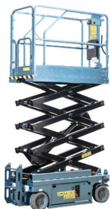
ZS0407/0607(w) Power Type: Electric Driving Type: HD Capacity: 280/230kg Working Height: 6.52/7.8m