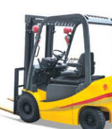
Explosion-proof electric forklift truck Model : CPD15Ex/CPD20Ex/CPD30Ex/CPD35Ex Cap. : 1500kg, 2000kg, 3000kg, 3500kg Lift height: 3m~5m Cert. No.: CNEx08.1896 Mark: Exd mbs II BT4 Gb/DIP A21 TA. T4