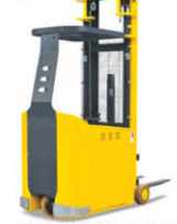
Narrow Aisle Forklift Truck (Option EPS) Model : CPD10A/CPD10B Cap. : 1000kg Lift height: 3~5m