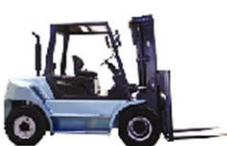
H50 Capacity: 5.0T Lifting Height: 3000mm Max. Lifting Height: 6500mm