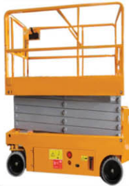
Self Propelled Scissor Lift 5 m

Lifting height 5m Load capacity 280kg Platform size 1.79m by 0.74m Battery : 4pcs*6/230 v/Ah