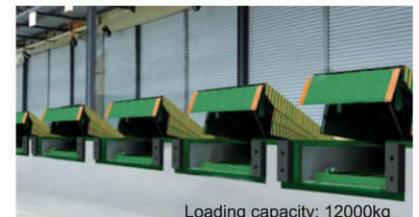
12t Stationary Hydraulic Dock Ramp

Loading capacity: 12000kg Lifting Height : +0.4/-0.3m Overall dimension : 2x2x0.6m