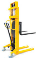
Manual stacker Model : SDJ500/SDJ00/SDJ1500 Cap. : 500kg, 1000kg, 1500kg Lift height: 1m~3m