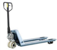
M25/30 Capacity: 2.5/3.0T Fork Width: 520/685mm Fork Length: 1150/1220mm Wheel: Pu/Nylon/Rubber