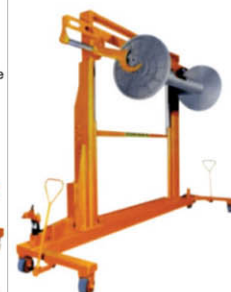
Hydraulic towel loom beaming vehicle Suitable for towel loom beaming (75") Capacity: 1000kg Overall size: 2450x700x2000mm