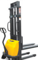
Semi-electric stacker Model: CDD10B-II/CDD15B-III Cap. : 1000kg, 1500kg Lift height: 1.6m~3m