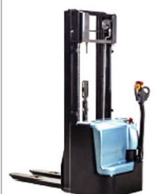
S20L Capacity: 2.0T Lifting Height: 3000mm Max. Lifting Height: 4500mm ZAPI Full AC Battery: 24V 240AH