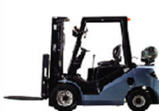
G30/35/40 Capacity: 3.0/3.5/mini4.0T Lifting Height: 3000mm Max. Lifting Height: 6500mm