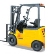
Four-wheel electric forklift truck Model: FB16/FB18/FB20 Cap. : 1600kg, 1800kg, 2000kg Lift height: 3m~6m