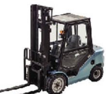
C35 Capacity: 3.5T Lifting Height: 3000mm Max. Lifting Height: 6500mm