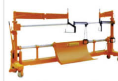
Hydraulic single-bucket beaming vehicle with frame Suitable for all kinds of beaming and transporting Capacity: 1000kg Overall size: depends on the specifications of the weaving machine