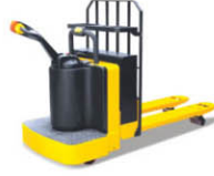
Electric pallet truck (EPS) Model: CBD25T/CBD30T Cap. : 2500kg~3000kg