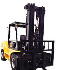
H90/100 Capacity: 9.0/10.0T Lifting Height: 3000mm Max. Lifting Height: 6500mm