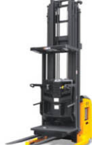
Electric high lever order picker Model: OPS15 Cap. : 1500kg Lift height: 5m~9m