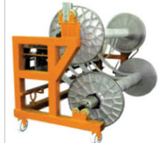
Double full loaded beam conveyor Suitable for storage and transportation for all kinds of double beam machine with frame