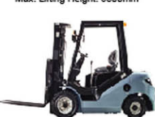
C25 Capacity: 2.5T Lifting Height: 3000mm Max. Lifting Height: 6500mm