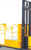
Order picker (semi-electric/full electric) Model: STD/SDD Cap. : 400kg Lift height: 3.5m~4.5m