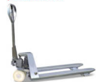
Stainless steel pallet truck Model: BFS Cap. : 2500kg