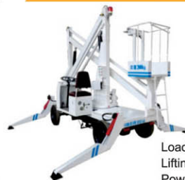
10.5m height aerial lift

Load capacity: 200kg Lifting height : 10500mm Power: Diesel