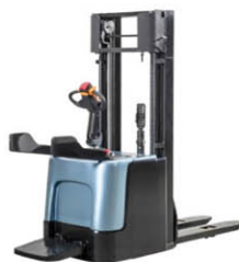
S16/18L-T Capacity: 1.6/1.8T Lifting Height: 3000mm Max. Lifting Height: 4500mm ZAPI Full AC Battery: 24V 270AH