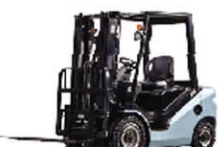
C18 Capacity: 1.8T Lifting Height: 3000mm Max. Lifting Height: 6500mm