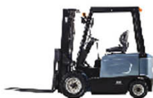
E20/25D Capacity: 2.0/2.5T Lifting Height: 3000mm Max. Lifting Height: 6500mm ZAPI Full AC