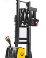
Narrow aisle lift truck Model: CDDRM-05/CDDRM-10 Cap. : 500kg, 1000kg Lift height: 3.3m