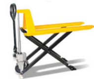
High lift pallet truck Model: JF Cap. : 1000kg