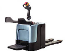
P16/18S-T Capacity: 1.6/1.8T Fork Width: 540/685mm Fork Length: 1150/1220mm ZAPI Full AC Battery: 24V 240AH