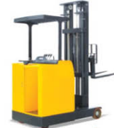
Electric reach truck Model : CQD10L/CQD15L, CQD10M/CQD15M Cap. : 1000kg, 1500kg Lift height: 3m~6.2m