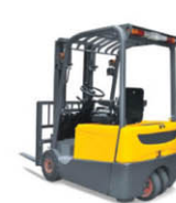
Three-wheel electric forklift truck Model : CPD20SA-16/CPD20SA-18/CPD20SA-20 Cap. : 1600kg, 1800kg, 2000kg Lift height: 3m~5.6m