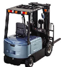
E20/25/30/35 Capacity: 2.0/2.5/3.0/3.5T Lifting Height: 3000mm Max. Lifting Height: 6500mm ZAPI Full AC