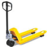
Hand pallet truck Cap. : 2000kg, 2500kg, 3000kg, 3500kg, 5000kg *photo shown BFill