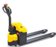
Semi-electric pallet truck Model : CBD10A-II/CBD10A-III/CBD15A Cap. : 1000kg, 1500kg