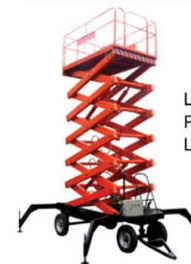
Mobile Work Platforms 14m

Load capacity : 300kg Platform size: 2800x1500mm Lifting height: 14000mm