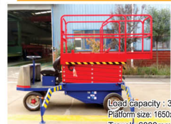
Trailer Scissor Lift

Load capacity : 300kg Platform size: 1650x800mm Travel: 6000mm