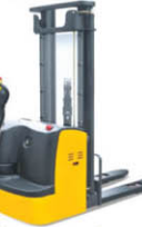
Full electric stacker Model : CDDR15-I/CDDR15-II (2.5m~5.6m) CDDR15-III (2.5m~3.3m) Cap. : 1500kg