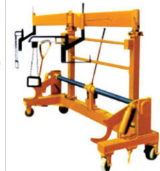
Hydraulic beaming vehicle with frame Suitable for all kinds of loom with frame beaming and transporting Capacity: 1500kg Overall size: depends on the specifications of the weaving machine