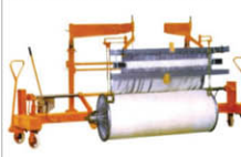
Hydraulic beaming vehicle with frame Suitable for all kinds of loom with frame beaming and transporting Capacity: 1500kg Overall size: depends on the specifications of the weaving machine