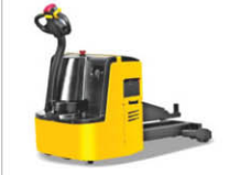
Pedestrian tow tractor Model: QDD25W Cap. : 2500kg