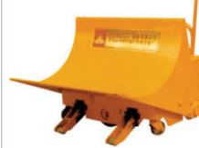
Hydraulic tipping beam conveyor Suitable for all kinds of sizing machine beaming and transporting Capacity: 1000kg (1000) Overall size: 1100x1050x900mm