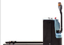
P20/25 Capacity: 2.0/2.5T Fork Width: 540/685mm Fork Length: 1150/1220mm ZAPI Full AC Battery: 24V 240/270AH