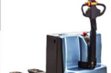
P30 Capacity: 3.0T Fork Width: 540/685mm Fork Length: 1150/1220mm ZAPI Full AC Battery: 24V 270AH