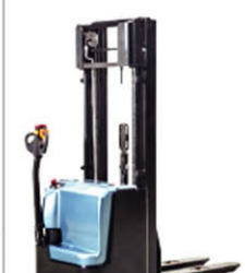
S14L Capacity: 1.4T Lifting Height: 3000mm Max. Lifting Height: 4500mm ZAPI Full AC Battery: 24V 210AH