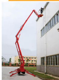
Articulated Track Boom Lift ALT18

Load capacity : 200kg Turntable rotation: 359°non-continuous Lifting height: 16000mm