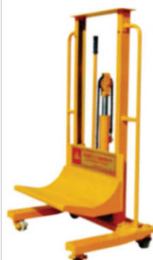
Hydraulic Elevating Plaiter Suitable for roller, able to cooperate with wide-in-order inspecting truck Capacity: 200 kg Overall size: 800x550x1346mm