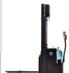
S16/18L Capacity: 1.6/1.8T Lifting Height: 3000mm Max. Lifting Height: 4500mm ZAPI Full AC Battery: 24V 240AH