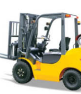
Gasoline & Dual fuel forklift truck Model : FG15/FG20/FG25/FG30/FG35 FGY15/FGY20/FGY25/FGY30/FGY35 Cap. : 1500kg~3500kg Lift height: 3m~6m