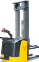
Electric stacker (Option EPS) Model : CDDK15-I/CDDK15-II (2.5m~5.6m) CDDK15-III (2.5m~3.3m) Cap. : 1500kg