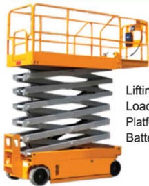
12m Electric Scissor Lift

Lifting height 11.557m Load capacity 230kg Platform size 2.26m by 1.13m Battery : 4pcs*6/230 v/Ah