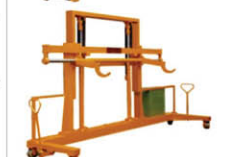
Electric towel loom beam truck Suitable for all kinds of double-layer beam, with electric warp beaming Capacity: 1500kg Overall size: depends on the specifications of the weaving machine