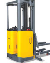
Narrow Aisle Lift Truck (Option EPS) Model: CDD15C Cap. : 1500kg Lift height: 5m~5.6m