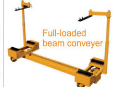
Full-loaded beam conveyor Suitable for storage and transportation for all kinds of double beam machine with frame