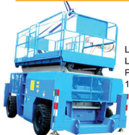
10m Diesel Power Scissor Lift

Lifting height 10.08m Load capacity 1150kg Platform size 3.95m by 1.83m