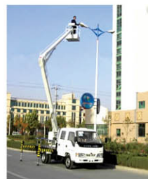
24m Boom Truck Lift Rental

Load capacity: 200kg Working height: 24000mm Working radius : 12000mm