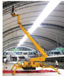
24m Spider Lift

Load capacity: 200kg Working height: 26000mm Rotation: 360