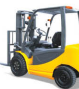
Four-wheel electric forklift truck Model: FB25A/FB30 Cap. : 2500kg, 3000kg Lift height: 3m~6m