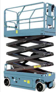
ZS1212 Power Type: Electric Driving Type: HD Capacity: 320 kg Working Height: 13.9m