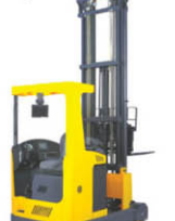
Electric reach truck Model : CQD20/CQD20H Cap. : 2000kg Lift height: 3m~7.4m, 8m~12m