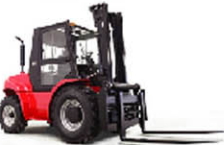
T40/50 Capacity: 4.0/5.0T Lifting Height: 3000mm Max. Lifting Height: 6500mm Drive Type: 4x2