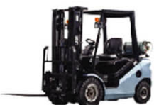
G15/18 Capacity: 1.5/1.8T Lifting Height: 3000mm Max. Lifting Height: 6500mm