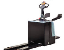
P10/12/14/15S-T Capacity: 1.0/1.2/1.4/1.5T Fork Width: 540/685mm Fork Length: 1150/1220mm ZAPI Full AC Battery: 24V 210AH