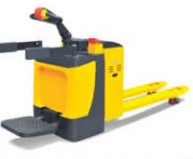
Electric pallet truck (Option EPS) Model : CBD20R-II/CBD20R-III/CBD25R Cap. : 2000kg, 2500kg