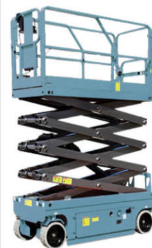
ZS1012 Power Type: Electric Driving Type: HD Capacity: 320 kg Working Height: 11.96m