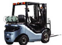
G20/25 Capacity: 2.0/2.5T Lifting Height: 3000mm Max. Lifting Height: 6500mm