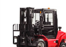
T20/25 Capacity: 2.0/2.5T Lifting Height: 3000mm Max. Lifting Height: 6500mm Drive Type: 4x2