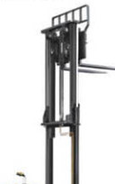
Counterbalanced electric stacker Model : CQD12W/CQD12R Cap. : 1250kg Lift height: 3m~5m