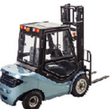
C30 Capacity: 3.0T Lifting Height: 3000mm Max. Lifting Height: 6500mm