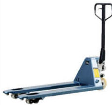
PH15/18 Capacity: 1.5/1.8T Fork Width: 520/685mm Fork Length: 1150/1220mm Battery: 24V 20AH Lithium